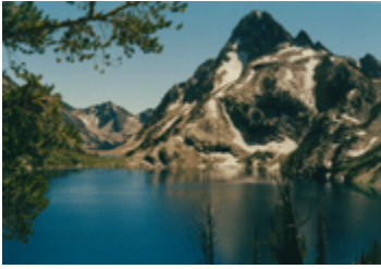
Idaho's pristine wilderness