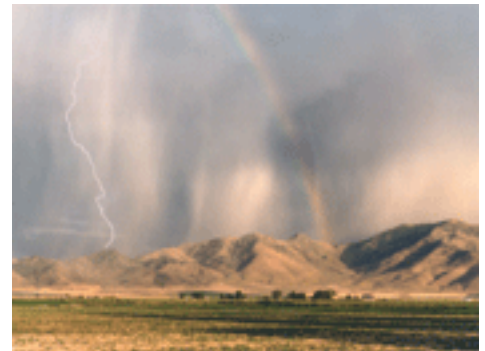
Rainbow and lightening storm on Camas prairie.

Much effort has gone into updating our website over the past year. Members can now learn about the IRHA, who its board members are, find the dates of upcoming board meetings, look at our bylaws, and get answers to questions. We also have links to upcoming events and to proceedings from our biennial conference. Just recently we added